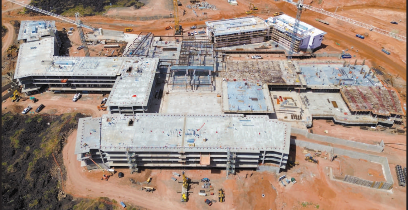
Baker Construction Enterprises ( No. 15 ) is providing foundation work and building elevated decks on the Black Desert Resort in Ivins, Utah. The firm will provide 1 million sq ft of structural slabs, along with 45,000 cu yd of concrete, 7.5 million lb of rebar and 500,000 lb of post-tension cables. The 600-acre resort is due to be completed in fall of 2024.

year to come is to maintain similar production levels while continuing to offer a quality product.”